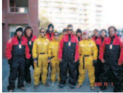
Vienna students getting ready to go on a whale watching trip, 2006.

Though we didn't talk much with the people in Toronto (because we stayed in our group) we were overwhelmed by the English language in Vancouver. The first two days we spent with our host families. They showed us Vancouver, took us to some parties of their friends and so on. In fact, we really had fun that weekend. On Monday we attended school at Point Grey School and were introduced to the Canadian school system. But we only had two lessons and afterwards we visited some sights of Vancouver like the art museum, Chinatown and Gastown. The next day