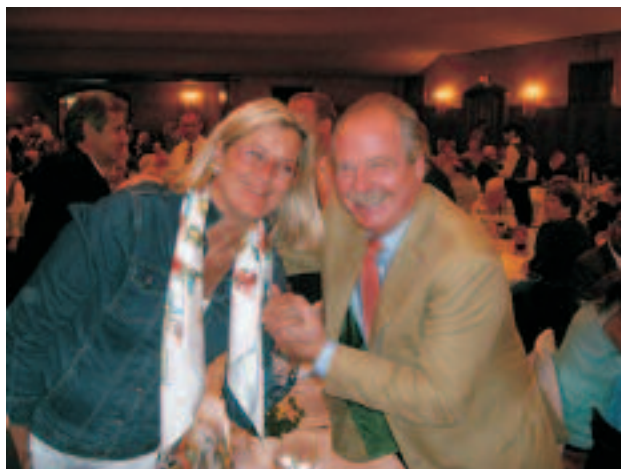
Sunday lunch with the Foreign Ministry. Left to right: Austrian Foreign Minister Dr. Ursula Plassnik and the "AÖWB Expatriate Member of the Year 2006", Friedrich von Thun