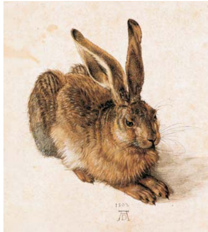
ALBRECHT DÜRER. Der Feldhase (1502)

After experiencing the incredible quality and freshness of the drawings at the Albertina, I began to hope that