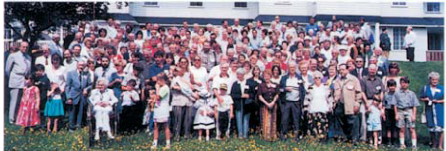
Rassemblement des Daigles avec l'Ambassadeur d'Autriche