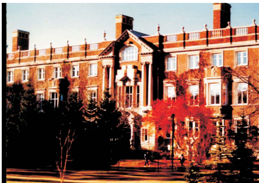
Arts Building at the University of Alberta, location of the Canadian Centre for Austrian and Central European

A strong international emphasis also marks the scholarly activities of the Centre. The "Central European Culture Today" Research Project, sponsored by the Austrian Ministry for Science and Transport, is engaging an interdisciplinary network of scholars throughout central Europe and