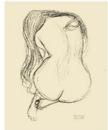
GUSTAV KLIMT. Seated nude woman

which are reproductions of items being shown at the Art Gallery of On-